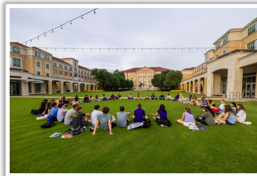
Orientation, Summer 2025.

Welcome to Spring 2026! Helping our students be successful by ensuring they are in the right courses at the right time, are tracking their own degree progress in PeopleSoft and Stellic, and are completing enrollment procedures in a timely manner is important to all of us. For this reason, we've put together what we hope is a handy reference sheet for faculty and staff as we all work together with students in the first couple of weeks of the semester to get them situated. Thank you for all you do!