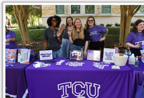
AddRan Advisors at our Welcome Back event.

We are grateful for all the help we can enlist in getting our students to complete these applications as soon as possible. The earlier they get on our radar, the better. Advisors, please also check—and encourage students to check—student advising reports as you help them plan. Thank you.