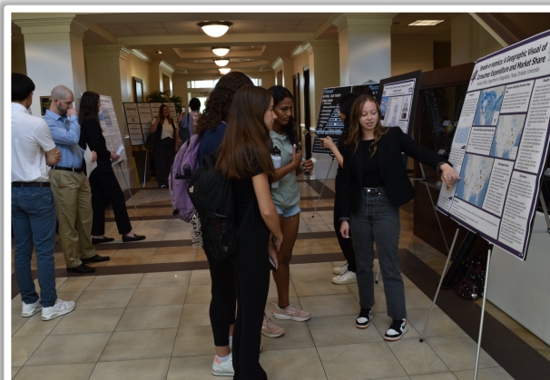
AddRan Celebration of Student Research.