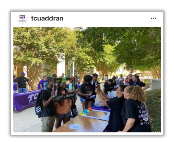
Students attending Welcome Back event, 2023.