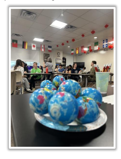
Educating global citizens.

Students who are on the waitlist will not automatically slip over into the course when a seat becomes available if (a) they are registered for another class at the same time (which they often are as a backup); (b) the addition of the class would push them over 18 hours; (c) they do not have the prerequisite for the class. If (a), ask students to drop the conflicting class. If (b), students will need to contact the Dean's Office to request an academic overload (see "Academic Overloads" on this document). If (c) and you still want to admit the student, the student will require a permission number. Here are instructions for students using permission numbers. Please do follow departmental policies in issuing the same.