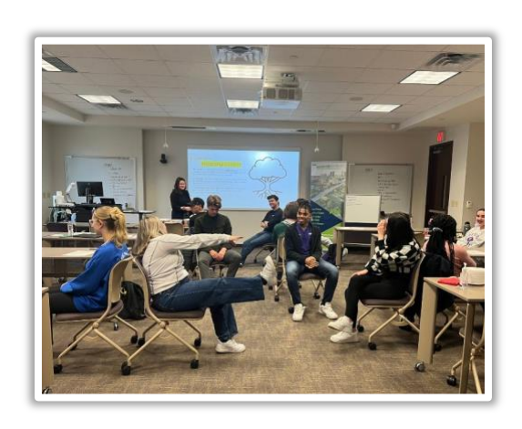
AddRan ambassadors participating in a leadership workshop.

If a student whose first major is in AddRan plans to graduate in December 2024 or May 2025, please encourage them early and often to file their intent to graduate before they finalize their schedules for fall 2024. The Dean's Office has sent e-mail reminders, posted QR codes around campus, and has the intent to graduate form available here on the website: <a href="https://addran.tcu.edu/intent-to-graduate.php">https://addran.tcu.edu/intent-to-graduate.php</a>. We are grateful for all the help we can enlist in getting our students to complete these applications as soon as possible. The earlier they get on our radar, the better. Advisors, please also check—and encourage students to check—student advising reports as you help them plan. Thank you.